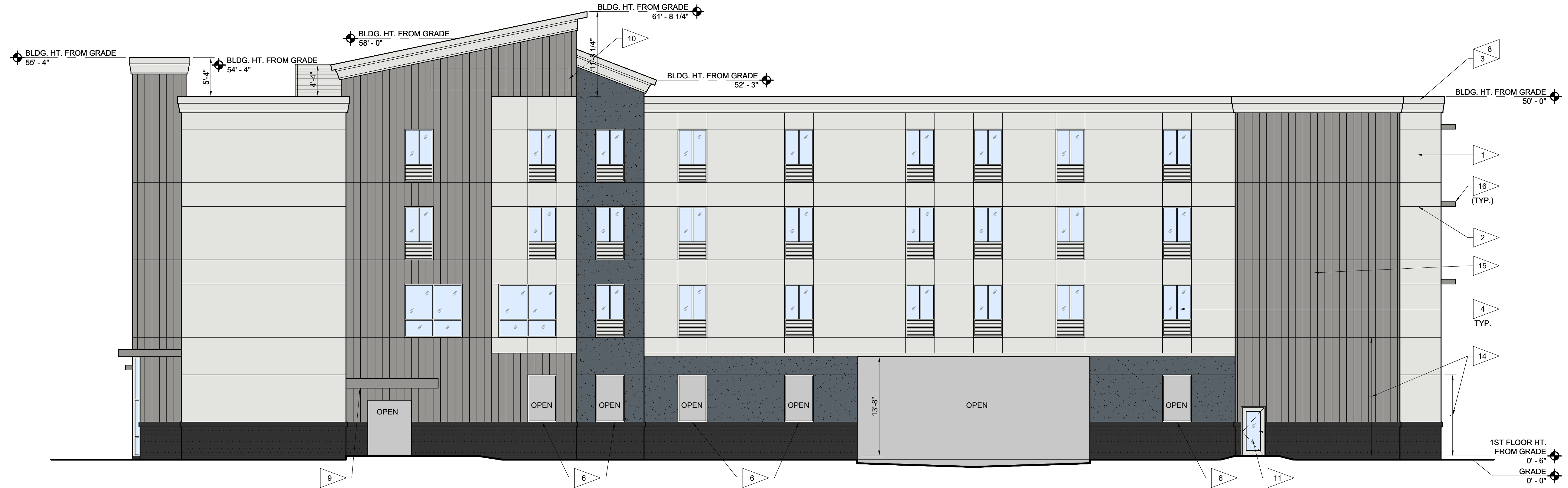
WEST ELEVATION ① SCALE: 1/8" = 1'-0"