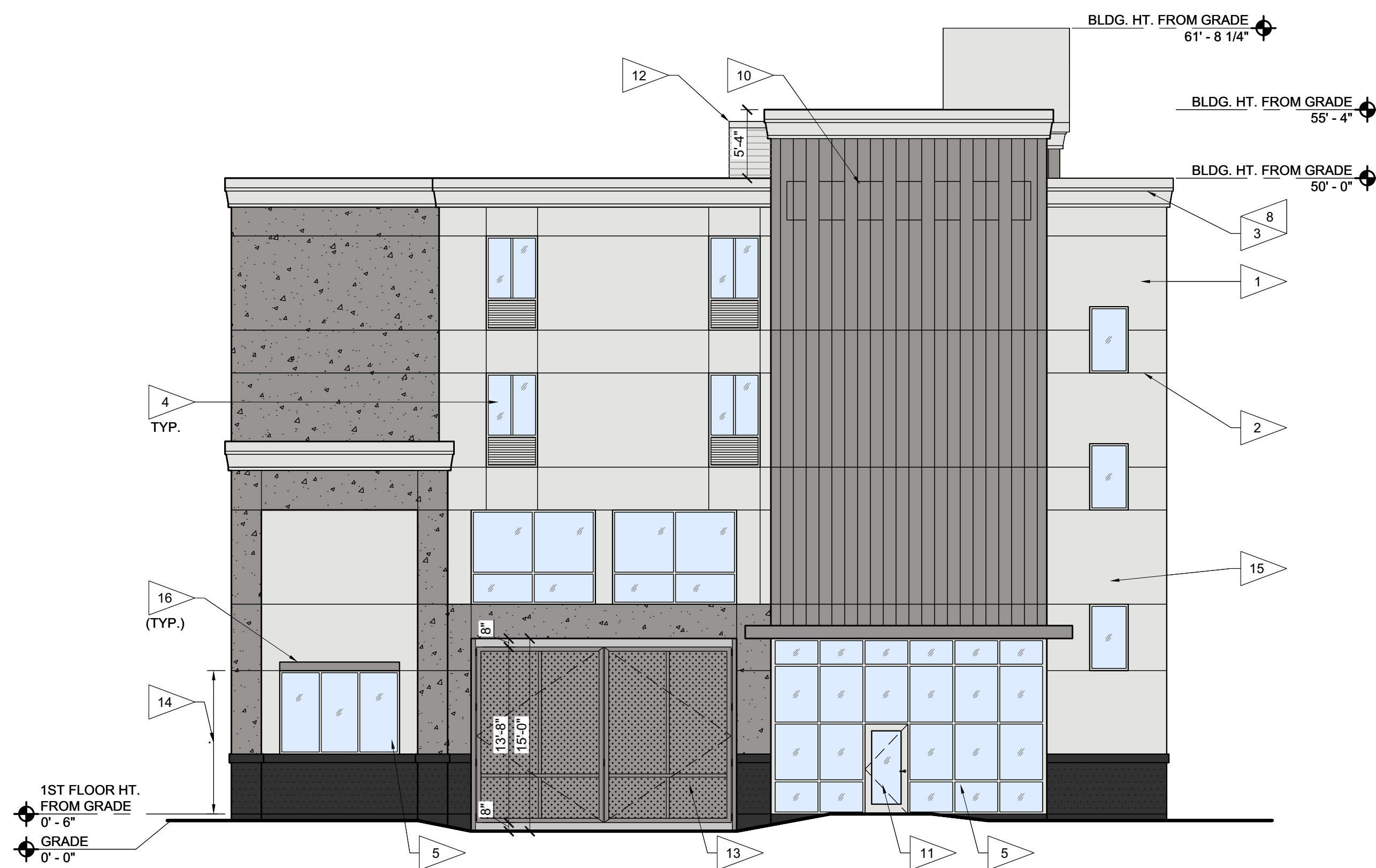
NORTH ELEVATION ② SCALE: 1/8" = 1'-0"